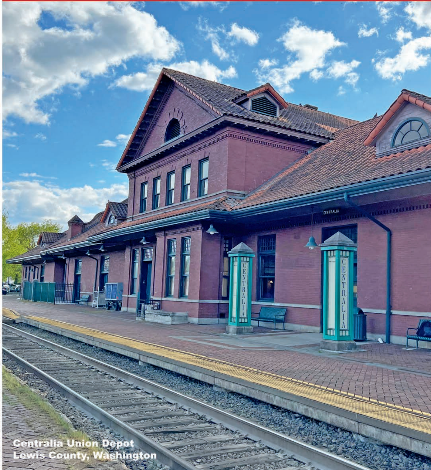
Centralia Union Depot Lewis County, Washington