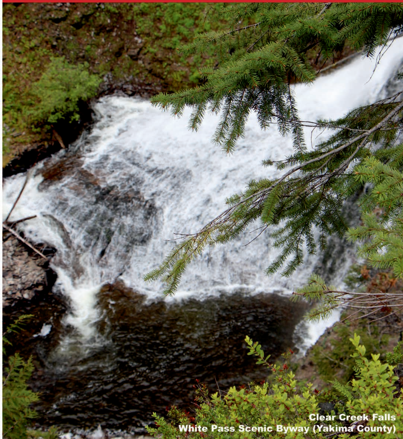
Clear Creek Falls White Pass Scenic Byway (Yakima County)